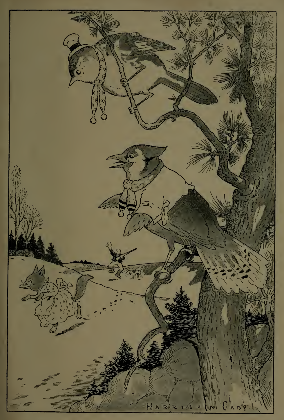
"OH, MY! OH, MY! WHAT NEWS THIS WILL BE TO TELL!" Page 53.